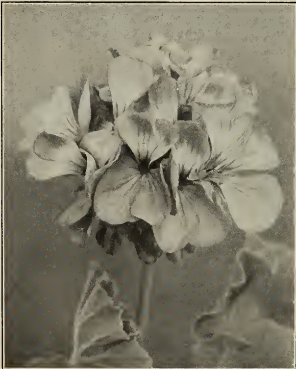
Rosalda—See page 15